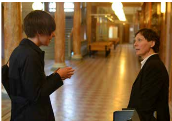
In Södra Latin High School