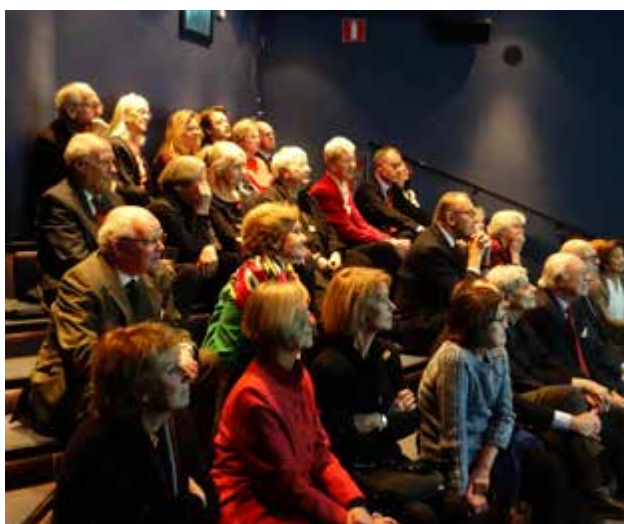
Preliminary presentation in Nobel museum