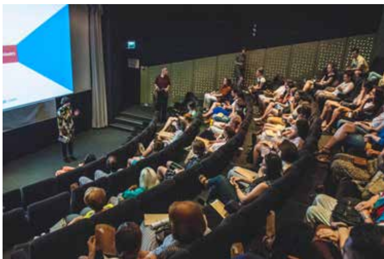
Premiere in Moscow