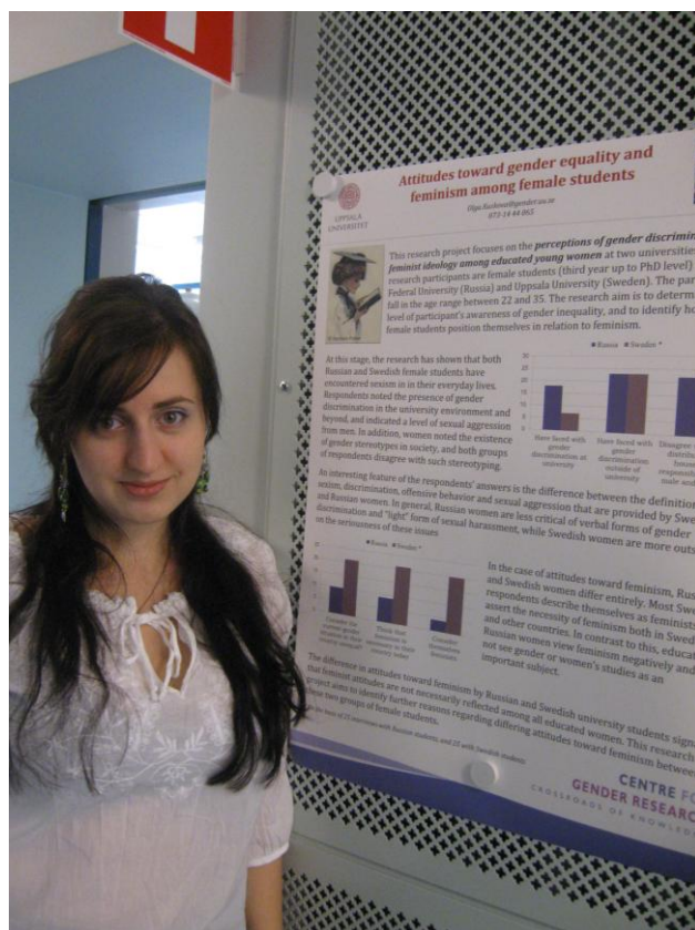
With my poster at the Open House

Informal communication was also wonderful. There is a “fika tradition” in the Centre – morning coffee at 8 o'clock, when everybody just arrives, the most numerous fika at 10, then – lunch, and the final coffee at 15. It's not just a meeting for coffee and small talk: there are discussions about research and debates on important gender issues.