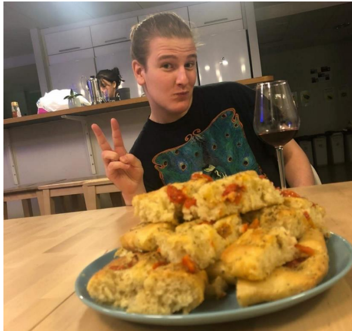
Student from Canada in my dorm

I have conducted social surveys among residents of Sweden, students, as well as foreign students with whom I lived in the dorm.