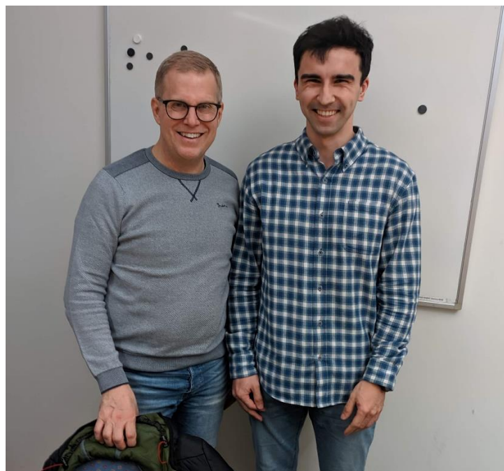
At Alcoholics Anonymous Meetings

I also managed to attend several meetings of Alcoholics Anonymous in English. It helped me to study sociological component and impact of alcohol on the society, quality and standard of living of the individual and society as a whole.