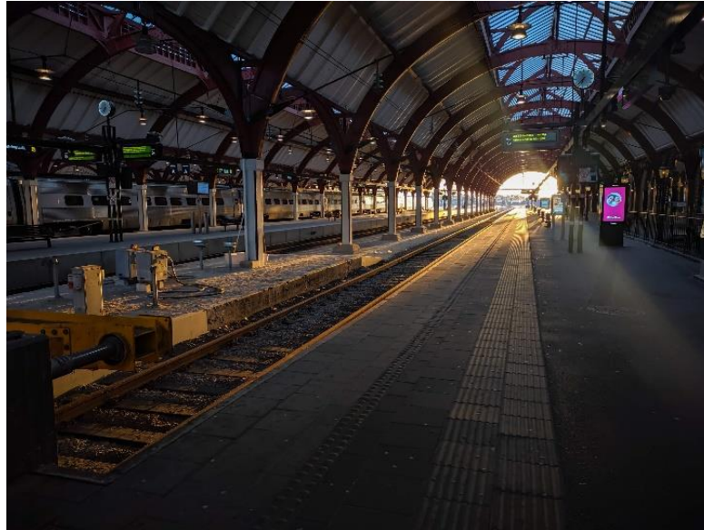
Malmö Central Railway Station

This all received international experience will have a positive impact on my education and give me valuable professional experience necessary to build a successful career.