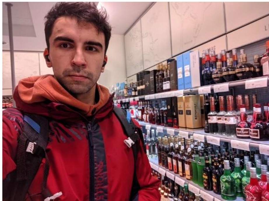
In Systembolaget Market

I was living in Malmo since March till July and I have studied practical examples and case studies from different municipalities in Sweden, found information by reading professional literature, laws, studying social polls etc.