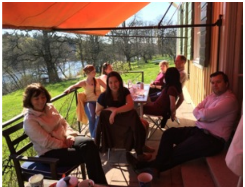
The celebration of Easter and the trip to Sigtuna